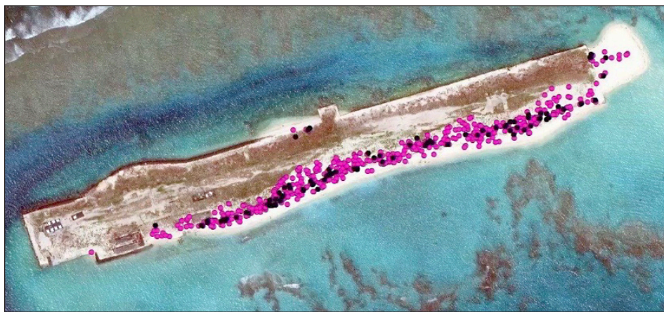
Green turtle nests on Tern Island in 2019 season. Pink dots indicate successfully deposited nests. Black dots indicate hatch craters and emergence of at least some hatchlings.

Federal observers are required on all Hawai'i longline vessels targeting swordfish, and on 20 percent of vessels targeting tuna. Cetacean expert Robin Baird and others have called for electronic monitoring on all vessels to ensure that crews actually handling false killer whale interactions do so in ways that reduce or eliminate mortalities or