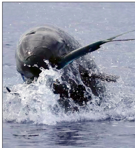
False killer whale

The SEZ closed last year for the second year in a row. NMFS is still reviewing all of the interactions in 2019 to determine whether or not to reopen the SEZ. Last year, there were 14 observed false killer whale interactions and one interaction with a whale that was not identified as a false killer whale, but was definitely one of the four species of black whales (also called blackfish) that live around Hawai'i. The SEZ was closed in