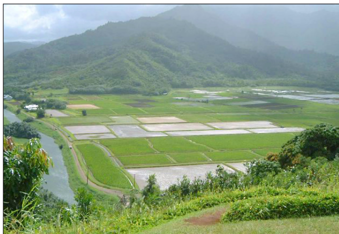
Hanalei taro fields