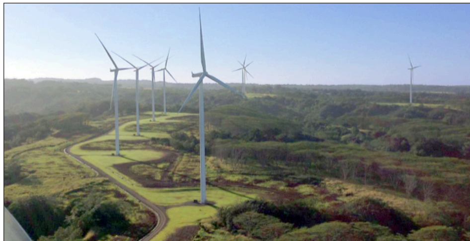
Kawailoa wind farm in North Oahu.