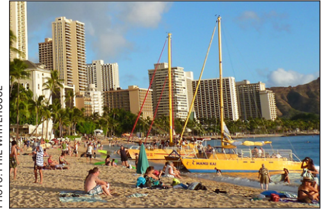
Catamarans on Waikiki Beach.