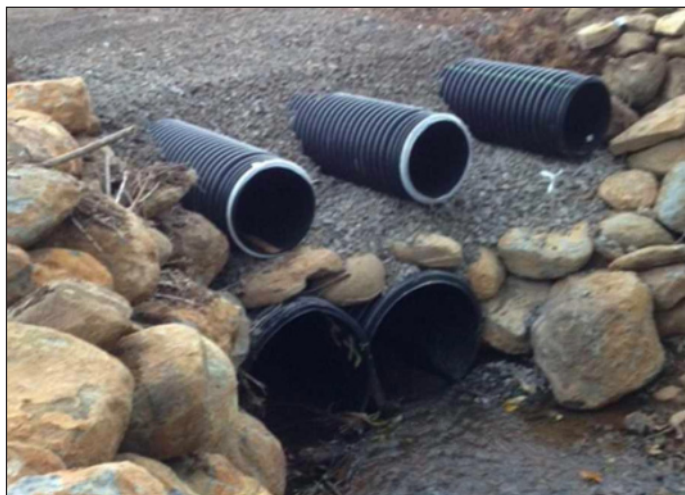
One of the unauthorized culverts constructed on Kuiaha Stream on Maui.