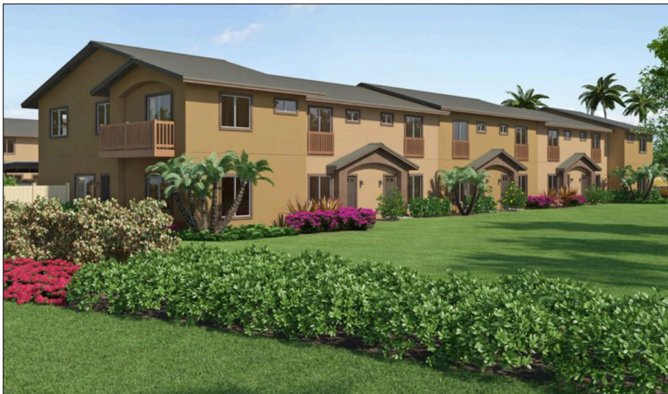
An artist's rendering of the townhouses.