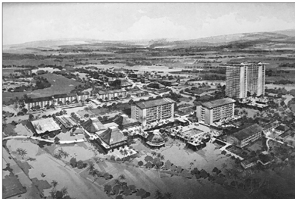
The development proposed for Discovery Harbour in the 1960s included retail and office space, as well as two high-rise hotel towers.

The application came at a time when the Planning Department was said to be on a “crash program” to include Ka‘u in the county’s General Plan. For that reason, the department asked the commission to defer action on the application. Separately, a Planning Department analysis of the application concluded there was “no basis for this amt commercial this time.” It is not clear that this was ever transmitted to the Planning Commission.