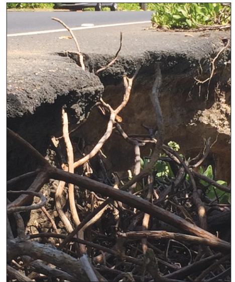
The fact that an eroding coastal highway is the only route through Ko'olau Loa is often raised by those who oppose further urbanization of the region.