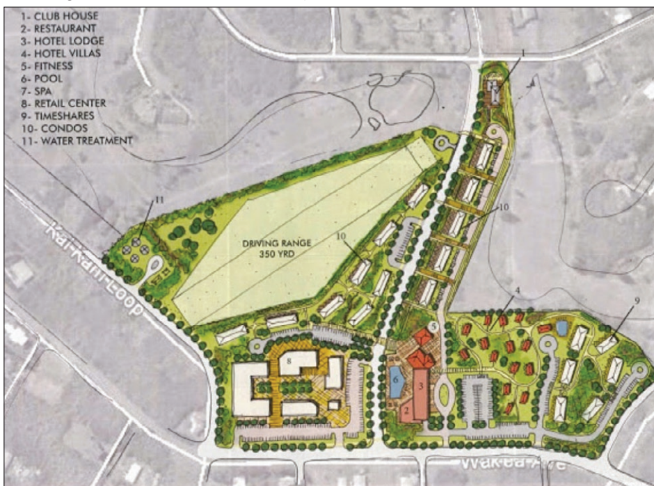
The current landowners' plan for the area includes hotels, time share units, condos, and other visitor amenities on 29 acres.

The first phase of development, he said, would involve construction of a golf course clubhouse, a restaurant, two seven-story buildings with 200 hotel units, plus restaurants, stores, and shops. A second phase of commercial development would include