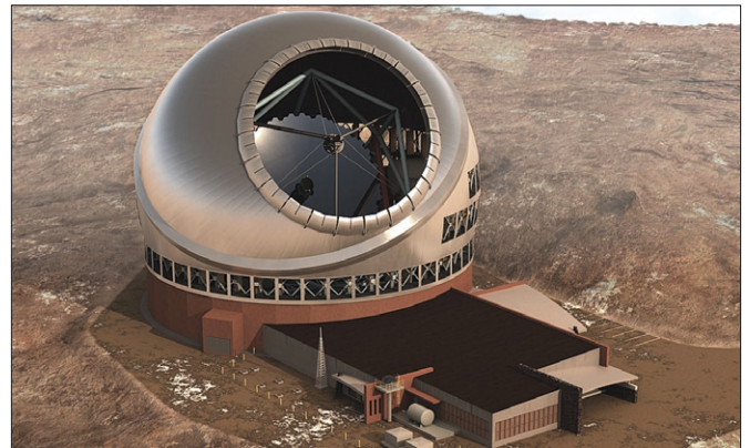
An artist's rendering of the proposed Thirty Meter Telescope on Mauna Kea.