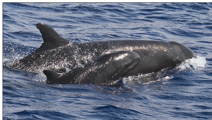
Hawaiian insular false killer whales.

For one thing, the required employment of weak fishing hooks has failed to keep hooked whales from breaking lines and swimming away with trailing gear that could threaten their survival. As recently as February, a false killer whale hooked in the mouth inside the exclusive economic zone around Hawai'i broke the line as the crew attempted to keep it taut and straighten the hook. The whale escaped with a wire leader and about 12 meters of fishing line attached to it, according to a description of the incident.