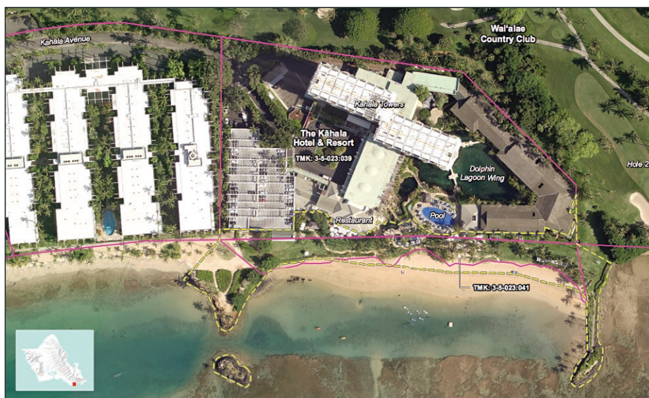
The dotted yellow line shows the approximate project area. The pink lines delineate tax map key parcels.

the beach area. ... [I]n reliance on that understanding the hotel expended substantial sums," he wrote. "The state is therefore estopped from requesting the hotel to remove the equipment under Hawai'i's judicial doctrine of equitable estoppel."