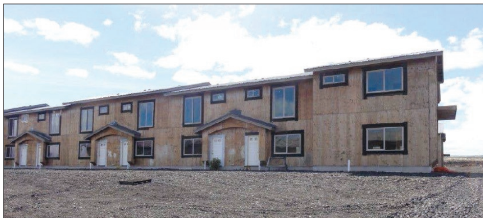
Work was found to be ongoing at the 'Aina Le'a site when Hawai'i County conducted an inspection last August.