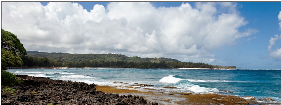
The most expensive project to be funded, in part, by the Legacy Lands program: the protection of coastal lands at Turtle Bay, O'ahu.

Bills that would have increased the amount of money going into the Legacy Conservation Fund — HB 69, 221, and 1570 — all passed first reading, but ultimately failed. — T.D.