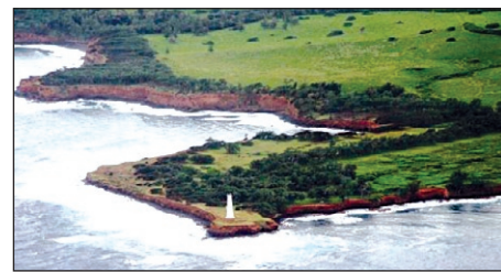
The non-profit Maika’i Kamakani ‘O Kohala used Legacy Lands funds to purchase 27.5 acres at Kauhola Point in North Kohala that contain important natural and cultural resources.

Act 172 is set to be repealed on June 30 of next year. Whether the Water Security Advisory Group continues beyond that time will be decided next year. The idea for the