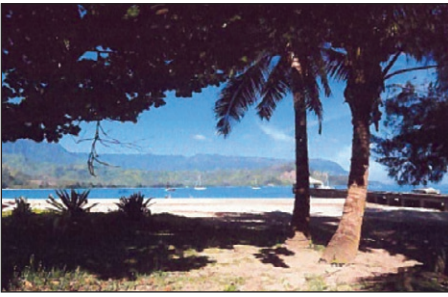
The County of Kaua'i used Legacy Land funds to purchase 0.74 acre on Hanalei Bay that are now part of Black Pot Beach Park, one of the most heavily used parks on the island.

The DLNR's Division of Forestry and Wildlife has received approval for the most Legacy Conservation projects. It's received some $3.2 million for pending and completed projects totaling more than 8,000 acres.