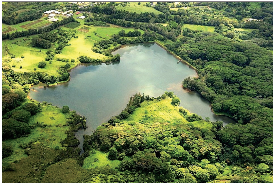
Wailua Reservoir on Kaua'i.

Taro Farmer Notes Failure Of State to Enforce Flow Standards