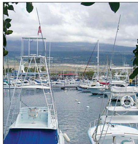
Honokohau Small Boat Harbor.