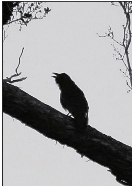
Wild 'Alala in silhouette.

This time around, the birds will be taught predator avoidance — by, for example, showing the birds models of hawks and sounding alarm calls — and will be released in an ungulate-free reserve that has rich, protective forest cover and fewer 'io than the Kona release site. According to Jackie Gaudioso-Levita of the Department