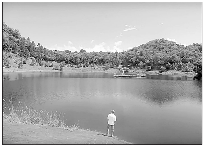
Pu'u Lua reservoir.