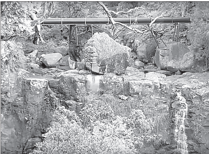
Part of the diversion system in West Kaua'i.

He continued that KAA's responses to questions regarding water use by association members contradict each other. Its initial response claims that three members — BASF, Pioneer Hi-Bred International, and Syngenta — have an estimated use of nearly 14 mgd. But later submittals from those tenants make clear they don't use that much, he said. BASF said it uses less than .5 mgd, Pioneer reported it used only 1.16 mgd, and Syngenta estimated that it used at most 2