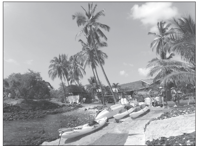
Kayaks at Kahauloa.