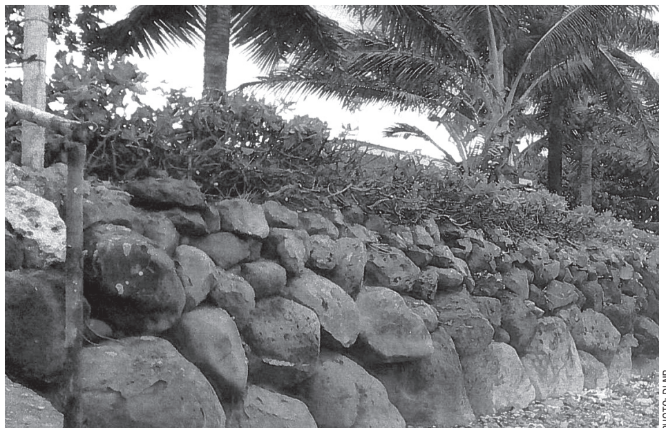
The Monge family's seawall in Hau'ula, O'ahu.