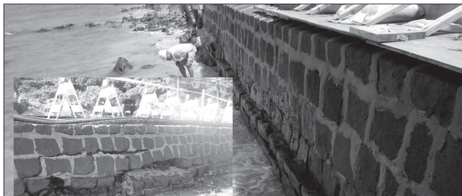
Emergency repairs of coastal infrastructure are expensive and disruptive. To repair this 610-foot stretch of Kamehameha Highway in Ka'a'awa — part of which crumbled onto the beach earlier this year — the state Department of Transportation has set aside $8 million. As of last month, the department was still considering whether to close the road entirely or partially, and whether work would occur 24/7 or only during the day. The highway is the only route in or out for the thousands of residents along O'ahu's northeast coast. Construction is expected to begin this month and end in August.