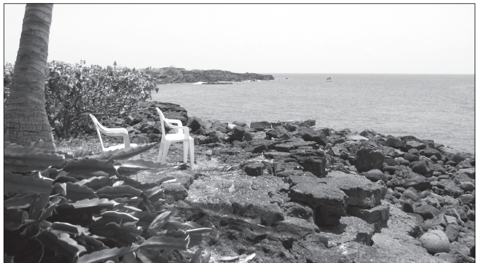
The coast near Kona's Honokohau small boat harbor. Legislation passed earlier this year has directed the DLNR to transfer development rights of three parcels there to the PLDC.