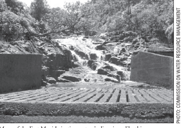
Many of the East Maui Irrigation system's diversions, like this one, are designed to take the base flow of streams.

The commission's decision addressed the flows of just eight of the 27 streams that were the subject of petitions filed seven and a half years ago that sought to amend stream flow to provide sufficient water to grow