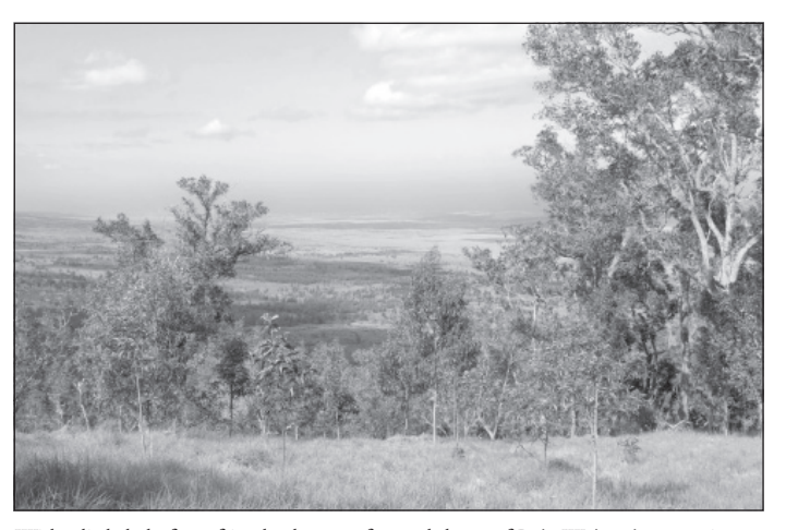
With a little help from friends, the once forested slopes of Puʻu Waʻawaʻa are again dotted with native trees.

But the land is benefiting, not only from Donoho's 24-7 presence (he lives in one of the ranch houses), but also from a work crew hired (with state funds) by a watershed partnership called the Three Mountain Alliance. (The alliance was formed by members of the