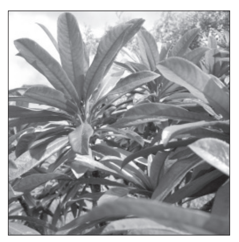
A healthy Clermontia is about to burst into bloom at an enclosure near the Pu'u Wa'awa'a forest bird sanctuary.

An advisory council meets regularly, dis-