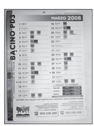
The March recycling calendar for Montagnana, Italy.

Although the more prosperous areas of Naples are clean, trash has been accumulating in poorer suburbs for months, to the point that the newly elected leader of Italy, Silvio Berlusconi, has announced he will personally oversee measures taken to resolve the problem.