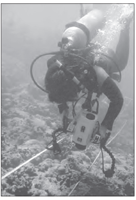
A diver using an underwater video camera to record benthic cover.

In their analyses of factors having the potential to affect the health of Moloka'i's reef, the USGS left practically no stone unturned. One chapter addresses suspicions that reef sediments may contain toxic materials from agriculture or other sources. (The answer? Not likely.) Another looks at the effect that flows of freshwater (from streams or seeps) could have on reef health.