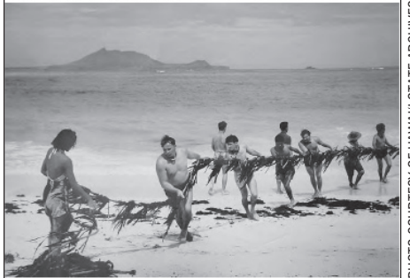
Hawaiians have traditionally harvested the sea for sustenance and cultural purposes.