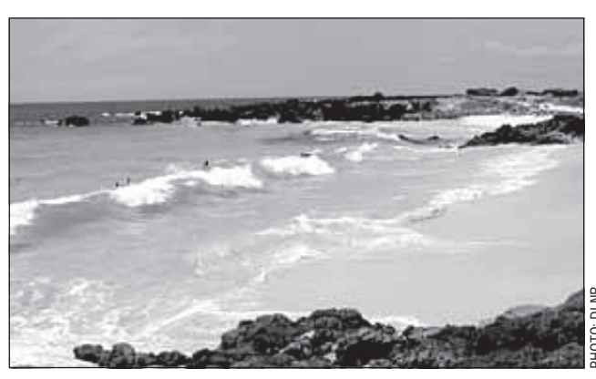
Kekaha Kai State Park

The new protocols involve "a substantial amount of proposed clinical tests – frankly