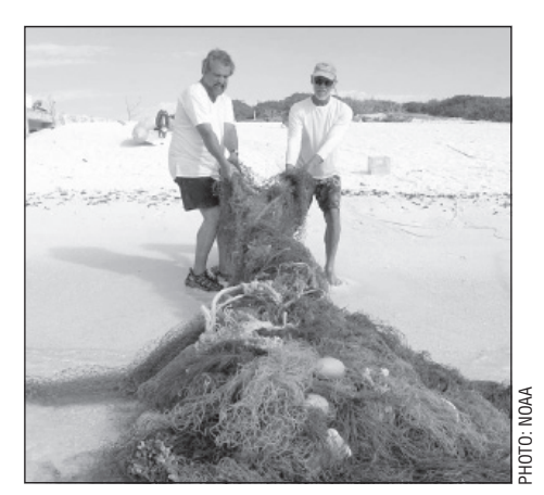
Managers removed more than 650 tons of marine debris from the Papahanaumokuakea Marine National Monument in 2007.

Hawaiian monk seal at Pearl and Hermes Atoll in October, while U.S. Fish and Wildlife Service staff worked to eradicate invasive terrestrial species, the report states.