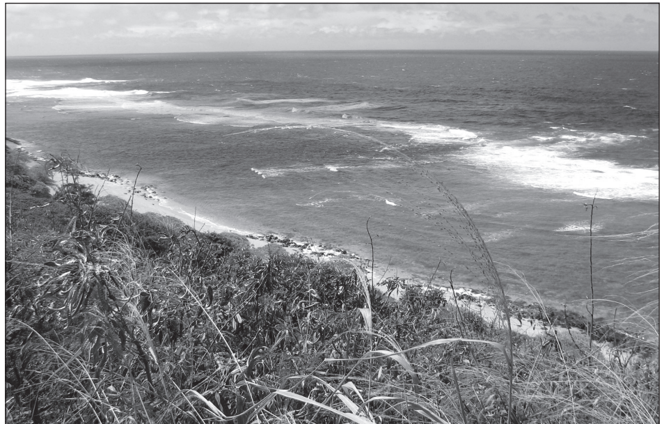
Lepeuli, North Kaua'i

Also in this issue you'll find a report on the Agribusiness Development Corporation's re-do of its October meeting, a summary of recent actions of the Board of Land and Natural Resources, and last, but by no means least, our public thanks to so many of you who contributed generously to our fall fund-raising drive.