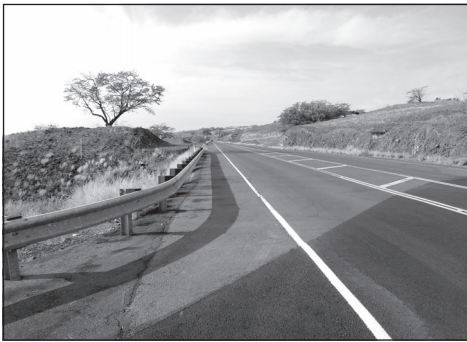
Left: The stretch of Akoni Pule highway that links the parking area for the Kohala Kai trail to the trailhead. Right: The three-vehicle public parking lot for the Kohala Kai pedestrian access.

Before the public can use the trail, the County Council must vote to accept it. After the council's Finance Committee deferred a vote on recommending the agreement to the full council last December, the developer and Planning Department staff tried to come up with a draft that would be more palatable. A draft agreement presented to the Finance