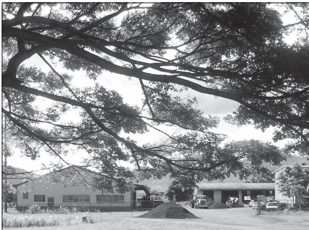
Some of the buildings on the 24-acre site in Whitmore Village the ADC recently purchased from Castle & Cooke.