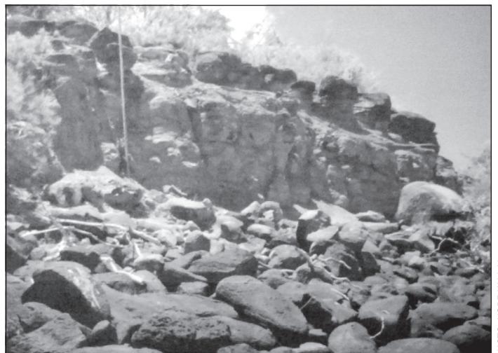
Terminus of proposed easement at Waipake.