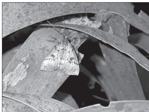
Koa Looper Moth ( Scotorythra paludicola )