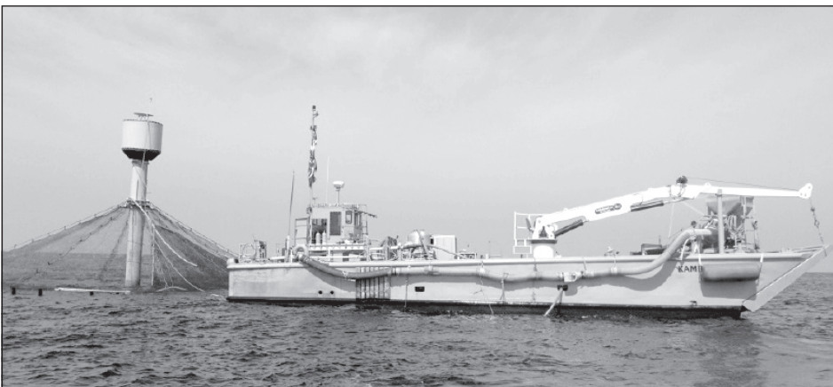
Workboat with spar pod