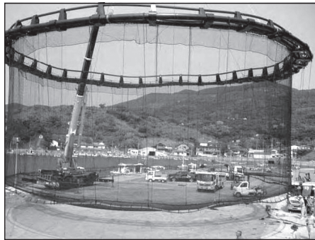
Surface net used by Blue Ocean Mariculture.