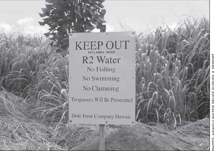
The quality of the R-2 water limits the types of crops that can be grown by Dole Foods.

DLNR and the DOH have generally supported releases from the reservoir and its irrigation ditch into Kaukonahua Stream for dam safety purposes. Whether those releases pose a threat to public health or are illegal is debatable. Regardless of the legal or health issues, the state is pressing forward with the measures ordered by the DLNR.