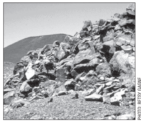
A portion of the Mauna Kea Ice Age Natural Area Reserve.

In a 2005 audit of the management of Mauna Kea and its science reserve, the state auditor criticized the lack of a comprehensive